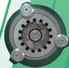
shredding ring and cutter