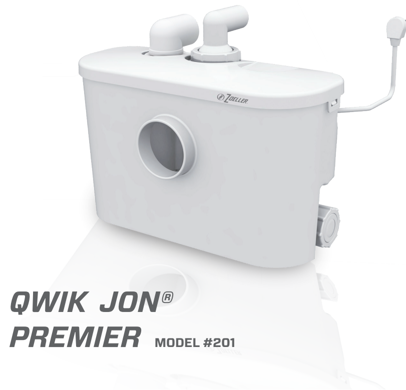
QWIK JON® PREMIER MODEL #201